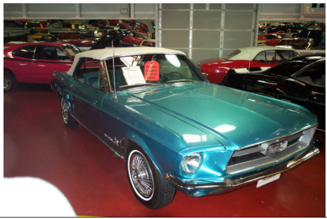
Car Show planning meeting

It's the holiday season again. Boy time flies too fast these days. I would like to wish everyone a safe and happy holiday. Don't forget that even though we may not have our cars out, there is still plenty to do in the club in the winter months. Check out the 2010 calendar for up coming events. Also don't forget to send in your 2010 Annual Dues!