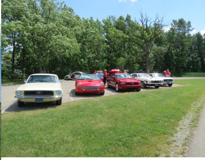
The June 2<sup>nd</sup> Marsh Run to the Horicon Marsh