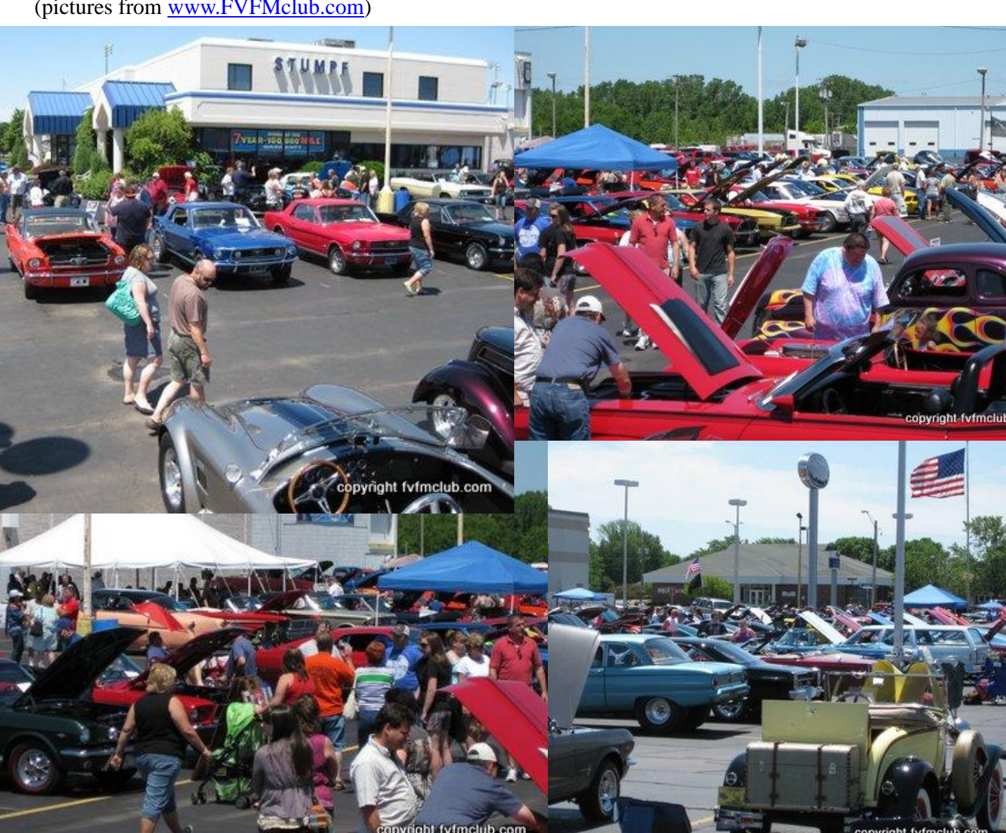
The June 17<sup>th</sup> Fox Valley Ford & Mustang Club all Ford show at Stumpf Ford in Appleton