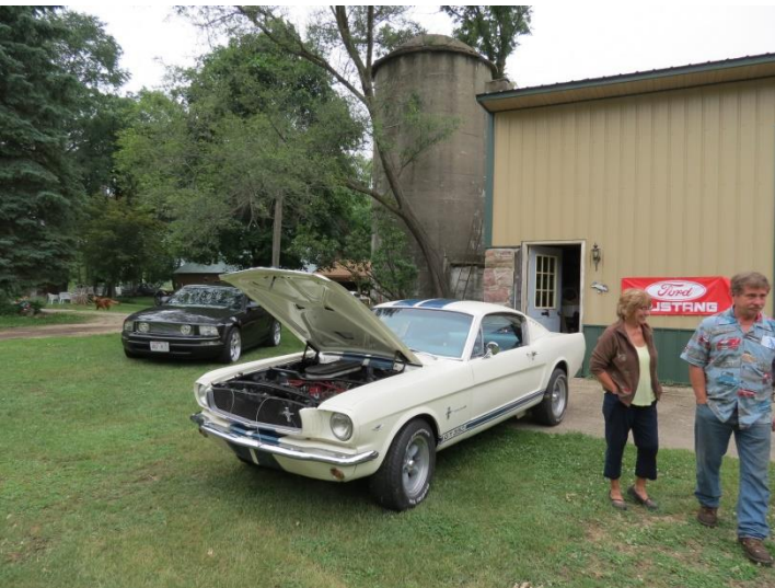
A Shelby clone