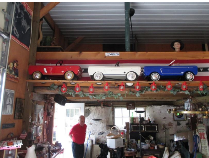
Some restored Mustang pedal cars in the barn.