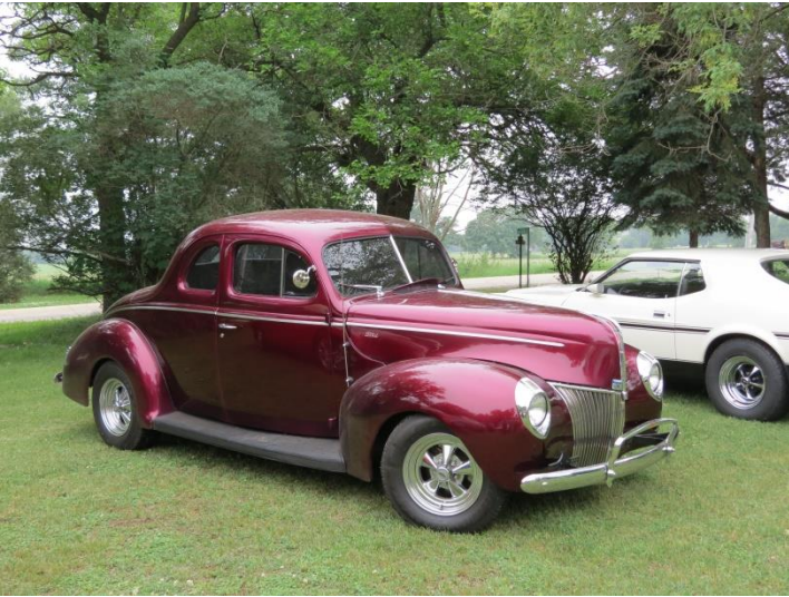
Modified '40 Ford