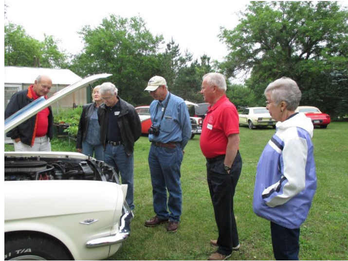
Checking out the 289 power