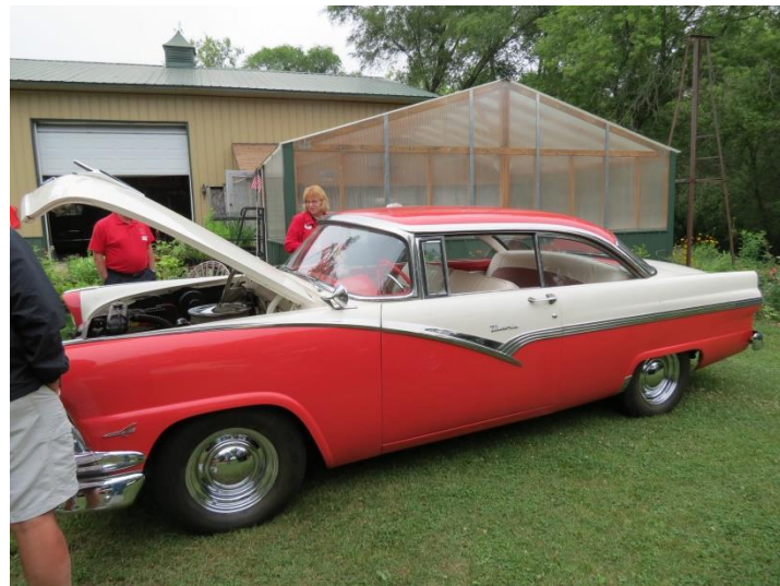
A beautiful '56 hardtop