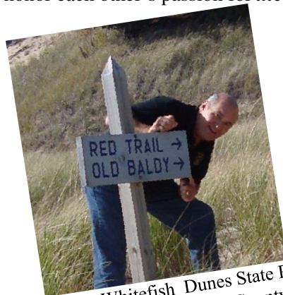
...at Whitefish Dunes State Park during the 2011 Door County trip.