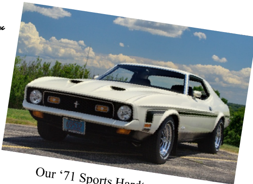
Our '71 Sports Hardtop