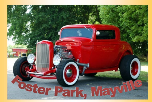
9:00 am - 3:00 pm Registration until 12:00 pm

Audubon Days Car Show Saturday October 6, 2018