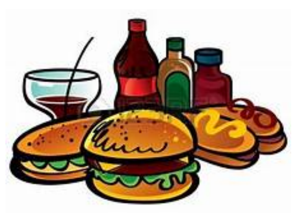
Burgers, Brats, Hot Dogs and beverages will be provided by the club.