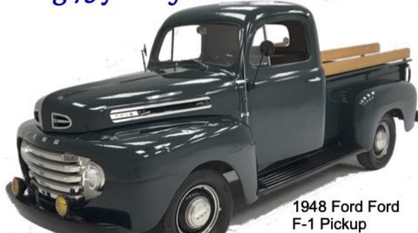
1948 Ford Ford F-1 Pickup

Celebrating 75 years of "F" series Ford Trucks