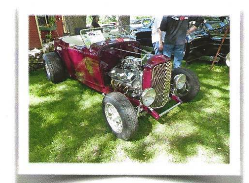
Bring your rod...