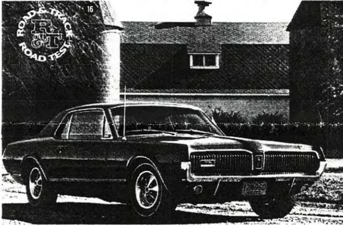
1967 MERCURY COUGAR

We are looking for original Cougars from 1967 to 1997 to display in our feature section. If you have a Cougar and want to participate please pre-register to guarantee a spot in the feature section. Special participant awards for all Cougars participating in the feature section.