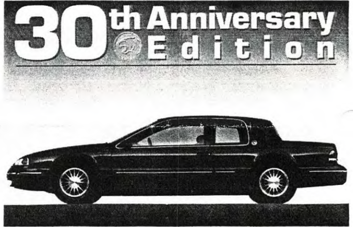
1997 - 30th ANNIVERSARY MERCURY COUGAR

All Makes Welcome — Trophies Presented In All Classes