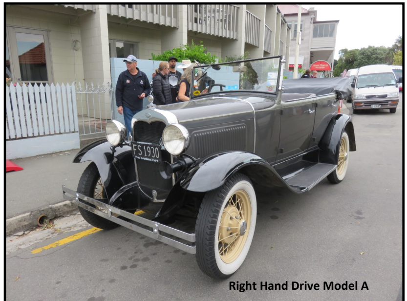
Right Hand Drive Model A