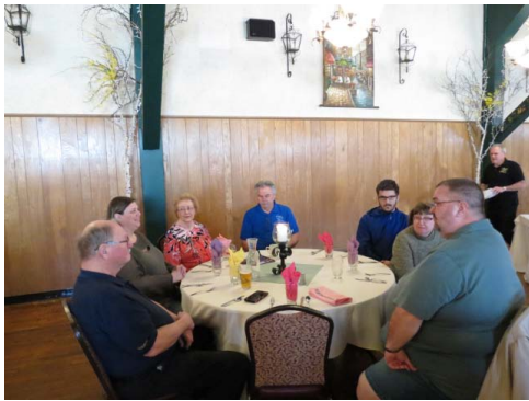
Wisconsin Early Mustangers Club Dinner 2019