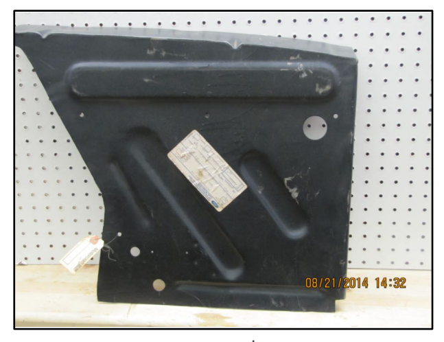
Left inner fender $40.00