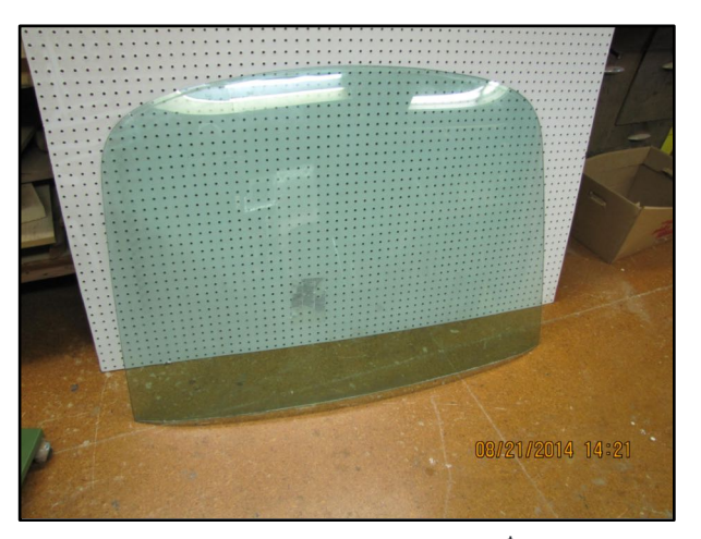
Fastback rear window $75.00 (Plus) 65,66 Hood Like new $100.00