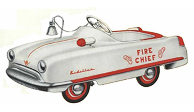
Evolution is not always a good thing

Today, a vintage Kidillac can sell for between $2,000 and $3,500! Classic cars, whether "real" or "toys," have one thing in common, they can truly appreciate in value.