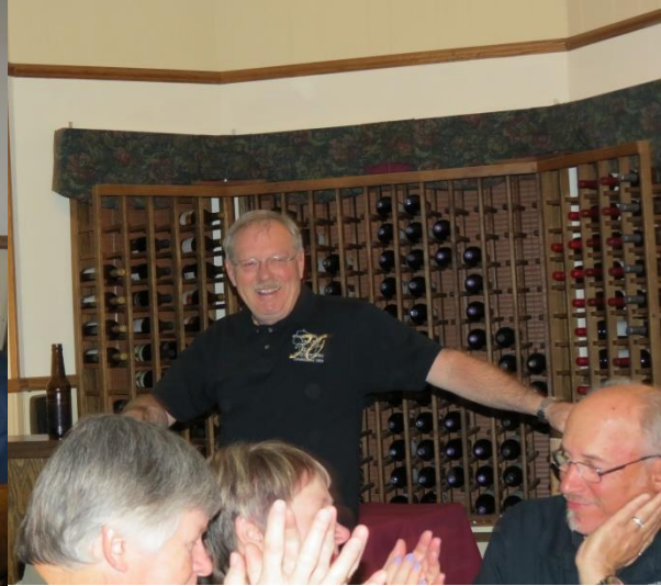
Saturday night dinner at the Nightingale