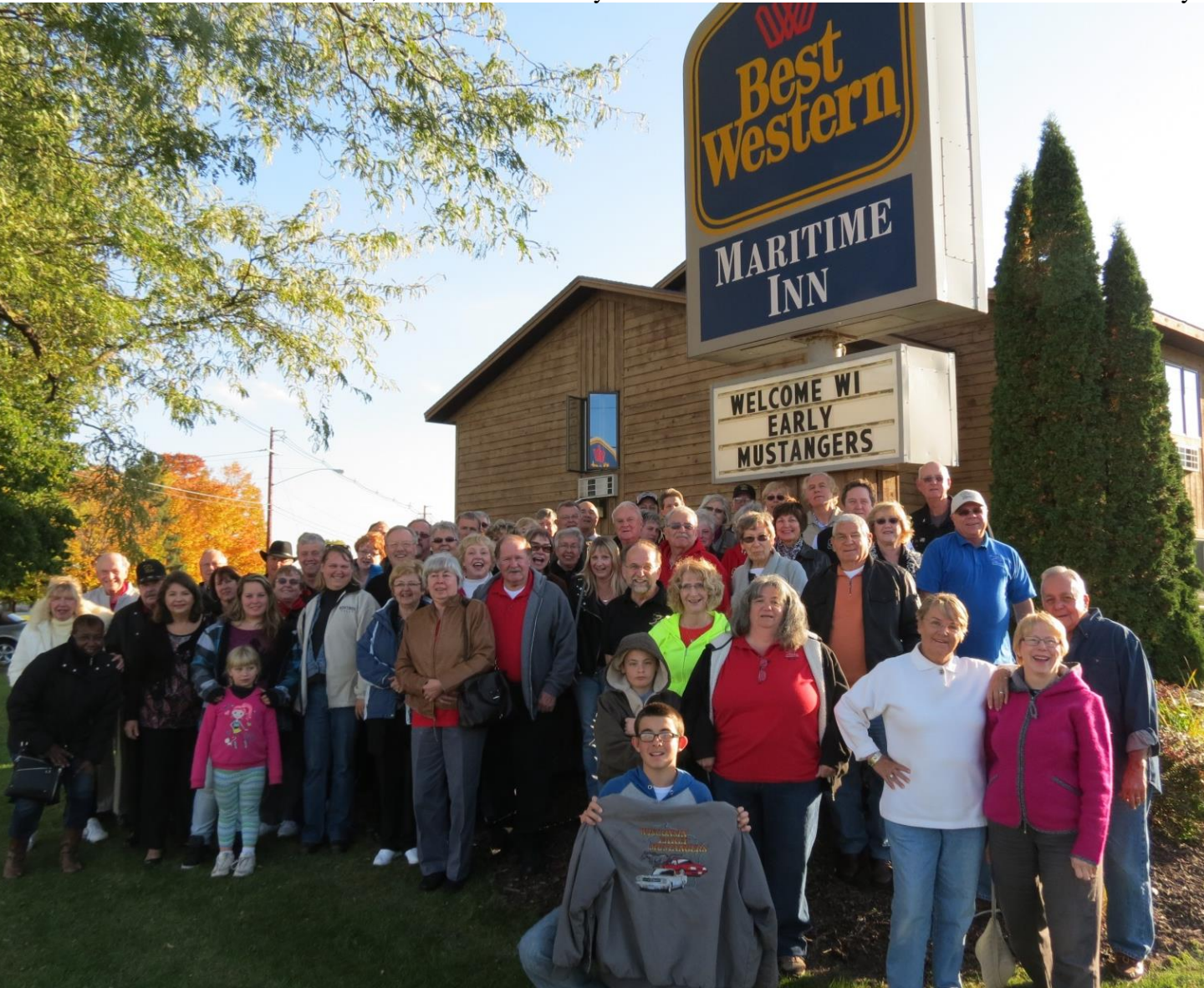
Our group at the Best Western just before going to our club dinner at the Nightingale on Saturday night.