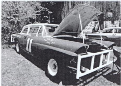
Bring your racer...