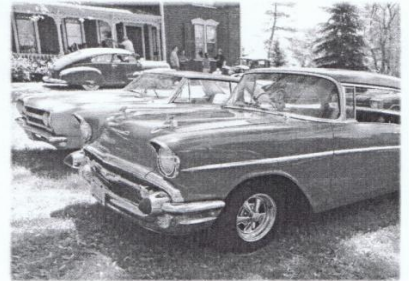
...classic, or antique!