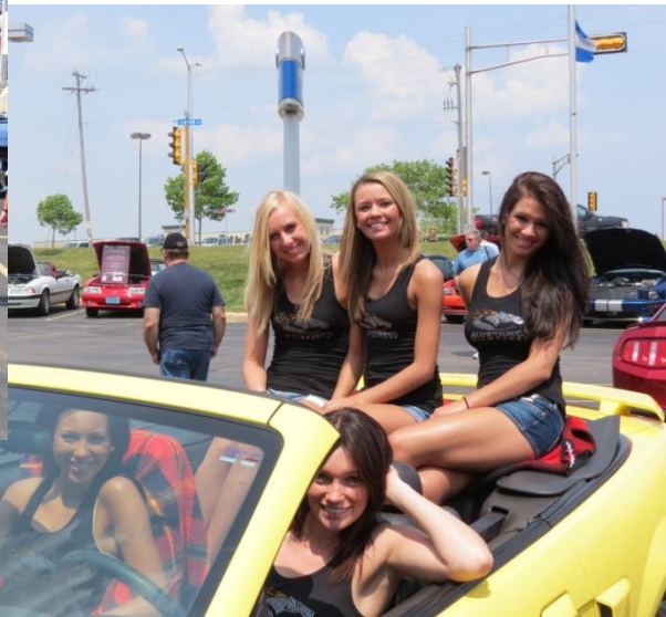
May 20 th All Ford Show at Ewald's Venus Ford, along with the Milwaukee Mustangs Fillies.