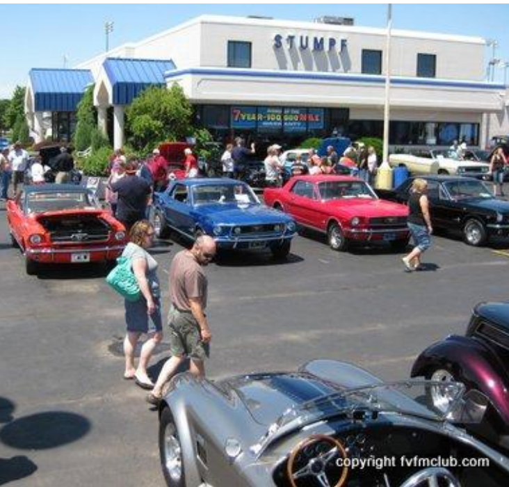
The June 17 th Fox Valley Ford & Mustang Club all Ford show at Stumpf Ford in Appleton