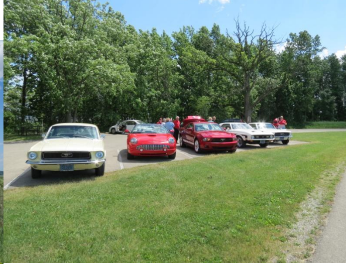
The June 2 nd Marsh Run to the Horicon Marsh