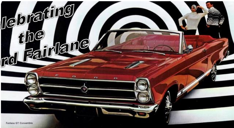
Fairlane GT Convertible