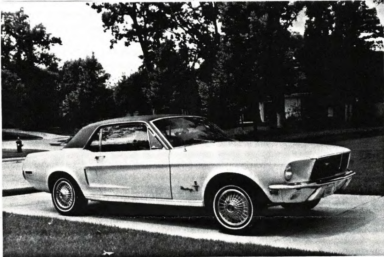
1968 MUSTANG COUPE OWNER: FRANK TROOST

I've had this '68 coupe for about 2 years and it is driven by my 16 year old daughter. It is yellow with a black vinyl top. Some of the features are: a 289 with a 2bbl, power steering and brakes. California car with a very straight rust free body and good original interior. It has about 85,000 miles on it and had been neglected mechanically. I've invested in new valves and lifters.