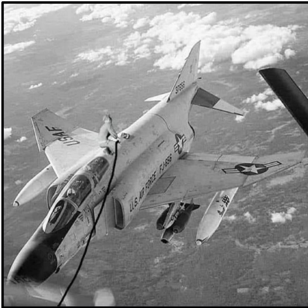
He washed the windshield and checked the oil too!

For Sale: Shed full of 65-68 Mustang parts. Windows, window regulators, power steering pumps, 289 radiator w/shroud, front kick panels, 3 speed manual transmission, rear end w/axels interior parts and more. Bring a trailer. $200.00 for the lot! Contact: Tom Miller 414-418-1538 7/1/23