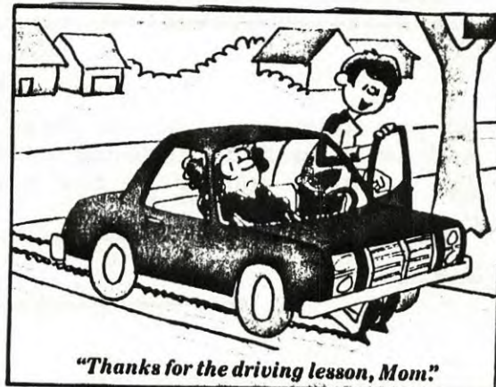
"Thanks for the driving lesson, Mom!"