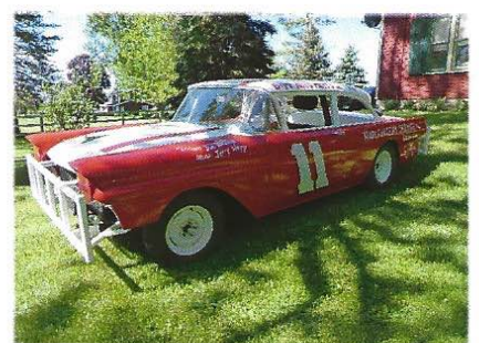
...antique, or racer!

For information or answers to questions about the event contact: