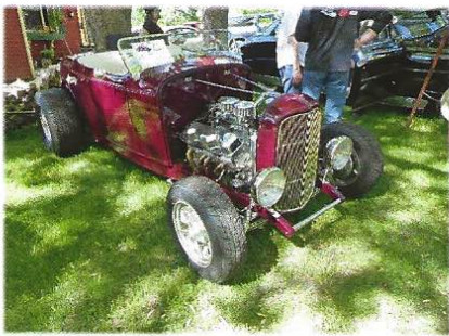
Bring your rod...