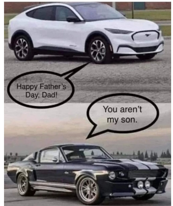
Evolution is not always a good thing

1970 Mustang Mach 1 parts for sale ( Georgia car ) Top loader 4 speed with bell housing and new & factory Hurst shifter $1,500 Drive shaft, leaf springs, rear drum brakes, 9" carrier (3.23 Gear) with 28 spline axels. Front/rear sway bars, steering box. Call Gary (414 ) 531-4681