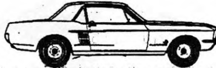
1967 MUSTANG COUPE