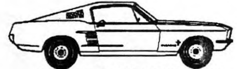
1967 MUSTANG FASTBACK

The 1967 Mustang is totally redesigned, with the engine compartment widened to accept the first big block - The 390-4V Thunderbird Special.