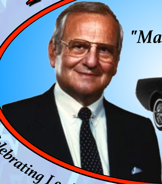
"Man Behind The Legend"