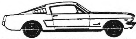
1965 MUSTANG FASTBACK 2+2